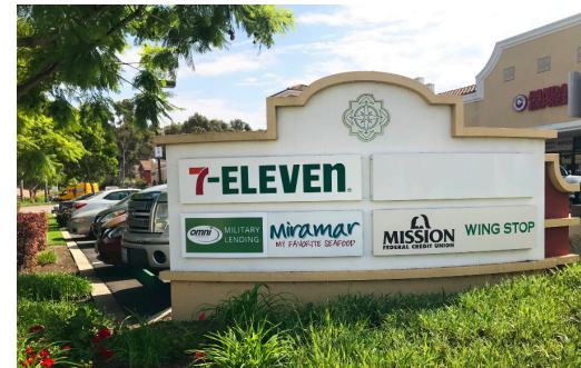
Lighted Corner Monument Sign