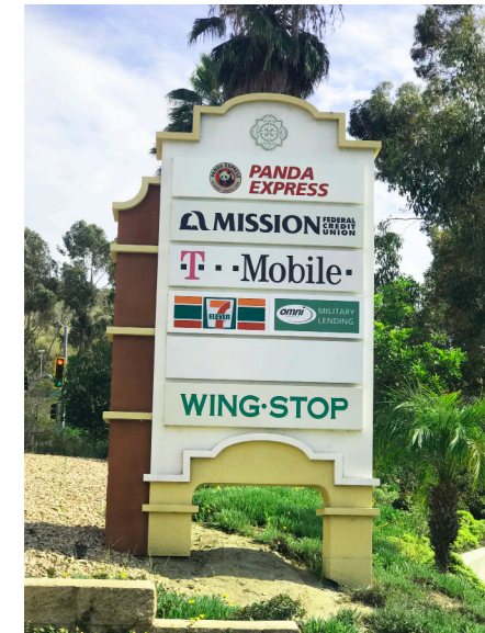
Lighted Pylon Sign

Premium corner suite available along 76 HWY with pylon and monument signage, and dual facade signage on south and east storefronts!