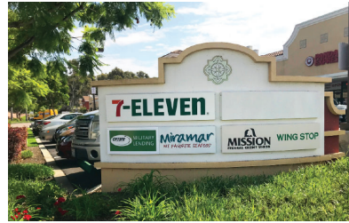
Lighted Corner Monument Sign