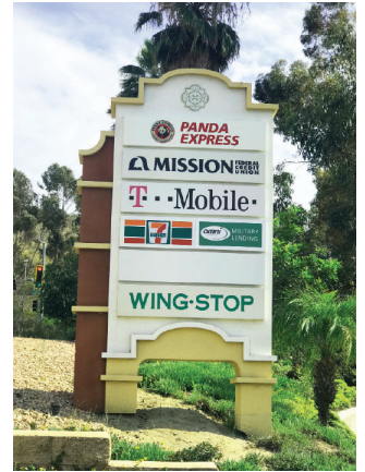
Lighted Pylon Sign

Premium corner suite available along 76 HWY with pylon and monument signage, and dual facade signage on south and east storefronts!